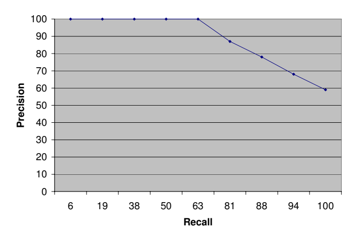
Fig. 3. Precision-recall curve (in percentage) for the Homo Sapiens