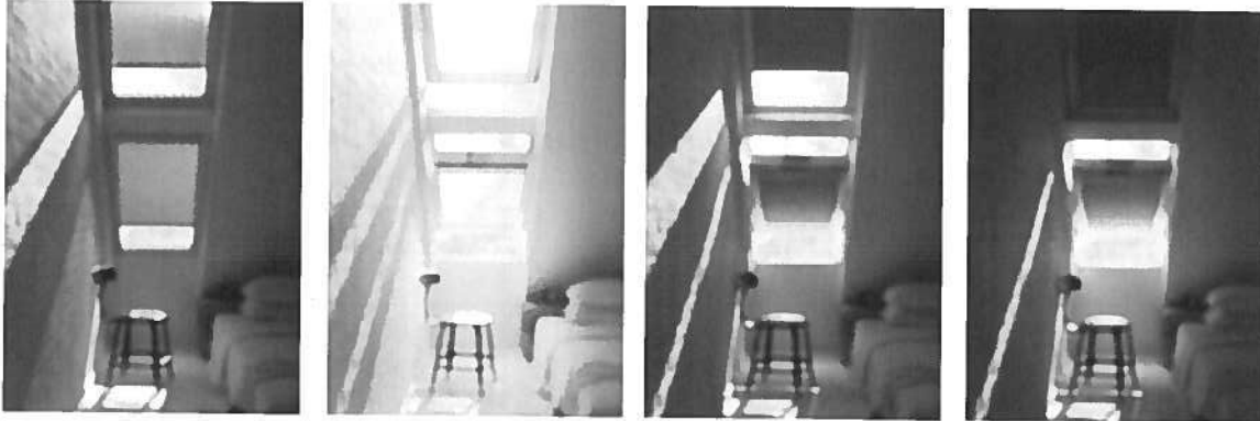
Figure 2 – Good blinds provide darkness at night, but control glare by day.

is not known yet exactly what light or dark dose each day is best. Moreover, field surveys show that individuals do not consistently self-select good conditions; some do not sit in the brightest spaces by day, and others keep blinds and curtains closed even when glare is not likely to be a problem. We do not yet know how best to promote good light (and dark) hygiene practices.