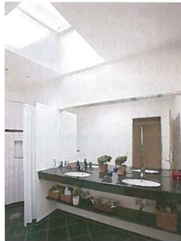
Figure 1 – A nature view aids restoration from daily stresses (left), but in some settings we prefer the daylight and privacy of a skylight (right).

Direct sunlight provides light and warmth, which some people believe to be therapeutic. Conversely, direct sunlight and a bright sky can both cause visual discomfort, particularly for the elderly; however, there are no models to predict this discomfort in residences. We know very little about the reasons for shades to be drawn at home, and have no guidance to solve the paradox created by the fact that the windows that provide the greatest feeling of spaciousness also lead to the worst discomfort, both visual and thermal (the latter both in the form of heat gain on a sunny day and radiant cooling on a dark winter day).