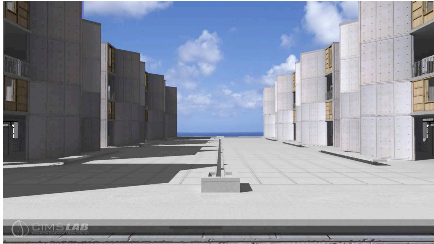
Figure 3: Generated model of Salk Institute from UCLP enabled collaborative work process