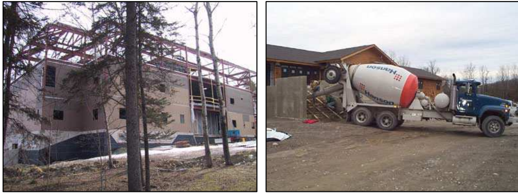
Figure 2: Visual Distractions Used – (a) An Example of a ‘Safe’ Visual Distraction and (b) the ‘Danger’ Distraction.

While using the application to enter data, participants will be required to be conscious of the images being projected and maintain a mental tally of the number of ‘danger’ photographs of which they were aware. Post-experimental analysis of the data will allow us to compare the actual number of ‘danger’ images projected with the number reported by the participants in order to derive a measure of awareness per participant. Unlike the noise levels, which we consider to be interfering distractions because they have the potential to interfere directly with a user’s ability to interact with the mobile device, we refer to these visual distractions as active distractions (the ‘danger’ photographs) because they require a participant to react to the distraction in some way – in this case, by tallying the number of instances of a given image – and passive distractions (the ‘safe’ photographs) because they distract the participants but do not require an active response.