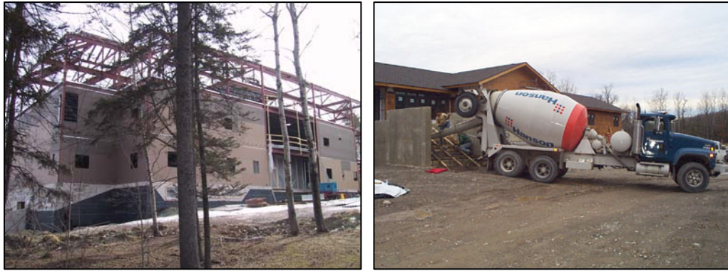
Figure 2: Visual Distractions Used – (a) An Example of a ‘Safe’ Visual Distraction and (b) the ‘Danger’ Distraction.

While using the application to enter data, participants will be required to be conscious of the images being projected and maintain a mental tally of the number of ‘danger’ photographs of which they were aware. Post-experimental analysis of the data will allow us to compare the actual number of ‘danger’ images projected with the number reported by the participants in order to derive a measure of awareness per participant. Unlike the noise levels, which we consider to be interfering distractions because they have the potential to interfere directly with a user’s ability to interact with the mobile device, we refer to these visual distractions as active distractions (the ‘danger’ photographs) because they require a participant to react to the distraction in some way – in this case, by tallying the number of instances of a given image – and passive distractions (the ‘safe’ photographs) because they distract the participants but do not require an active response.