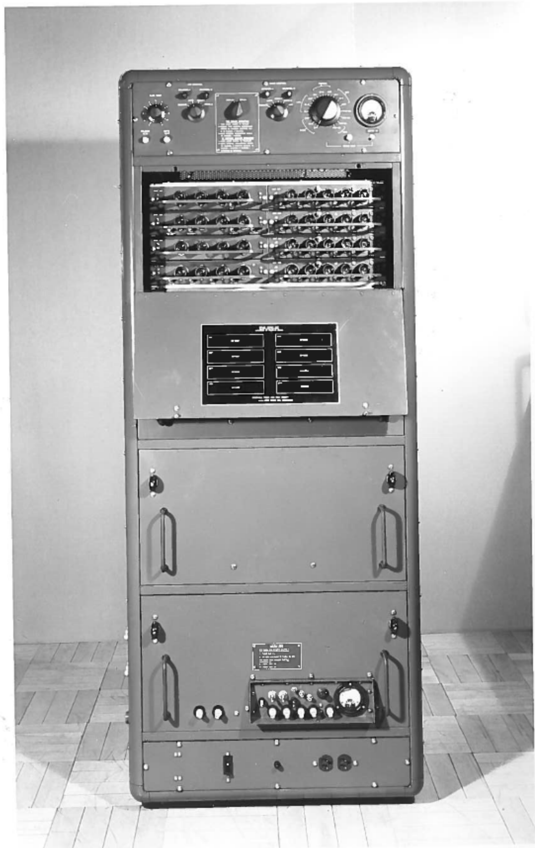
Plate II — Service test model of duplex gating unit (Front open to show module construction)