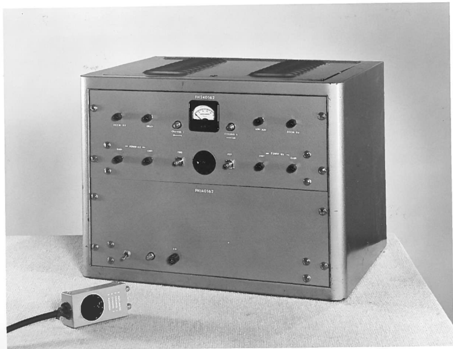
Plate I — Experimental model of duplex gating unit