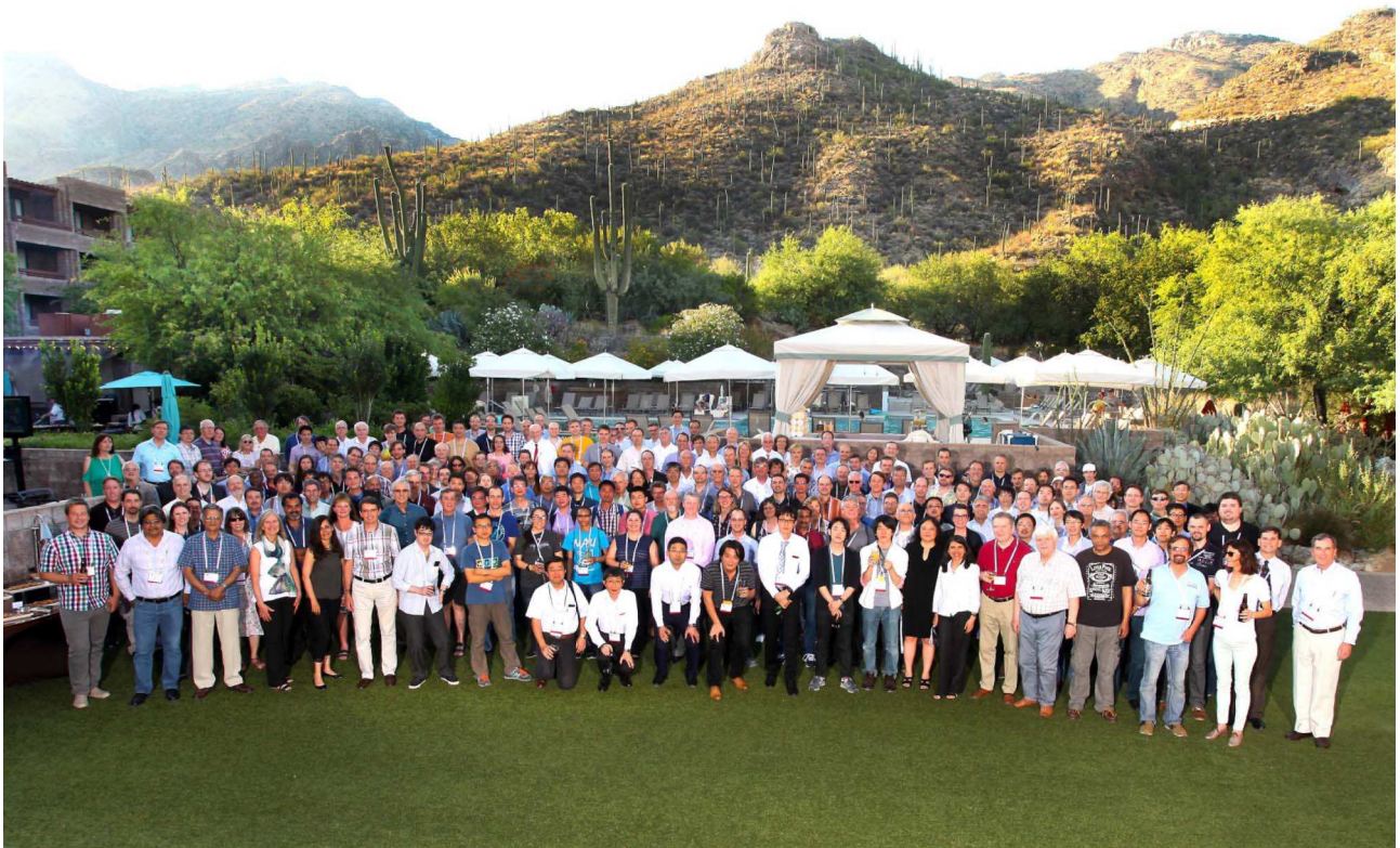
Fig. 3. 2016 OIC conference group photo.

An added benefit to attendees, OIC provides many opportunities to network with peers, including poster sessions,